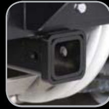
2-Inch Front Receiver Hitch