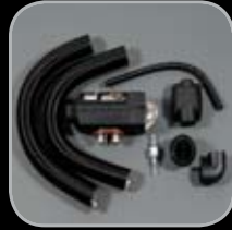
Cab Heater (Gas Only)