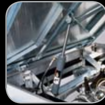
Electric Bed Lift