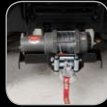
2,500 lb Warn Winch