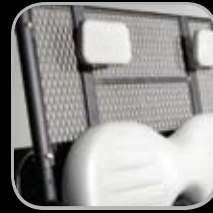
Rear Cargo Cage