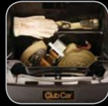
Underhood Storage (Gas Only)