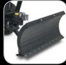
54- or 62-Inch Plow Blade