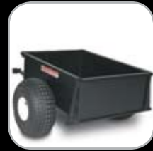
Swisher Dump Cart